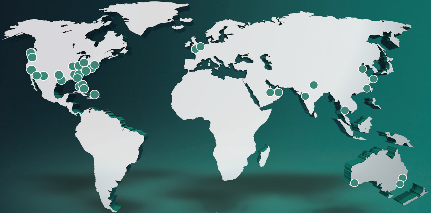
○ Ankura Office Locations

2,000+ professionals serving 3,000 clients across 115+ countries